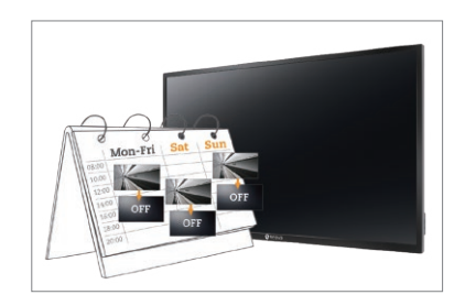
Built-in scheduler automatically activates and deactivates the PM-32 with designated input signal according to programmed schedules