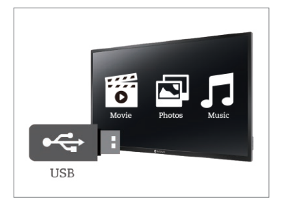
USB Playback for easy multimedia content presenting